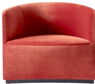
City Velvet CA7832/062