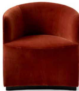
City Velvet CA7832/062