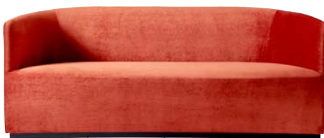
City Velvet CA7832/062