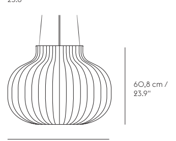
Ø 80 cm /